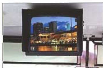
TV & VTR (option)