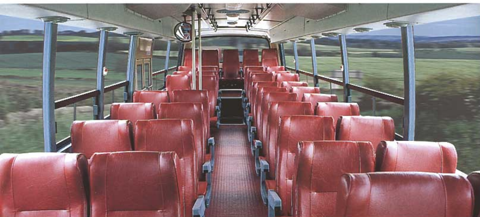
2 x 2 Seat arrangement with middle door