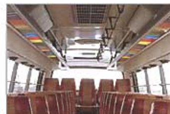
Inside rack - Mood lamp (option)