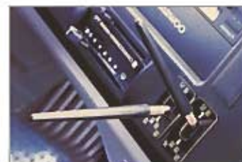
Air pressure switch