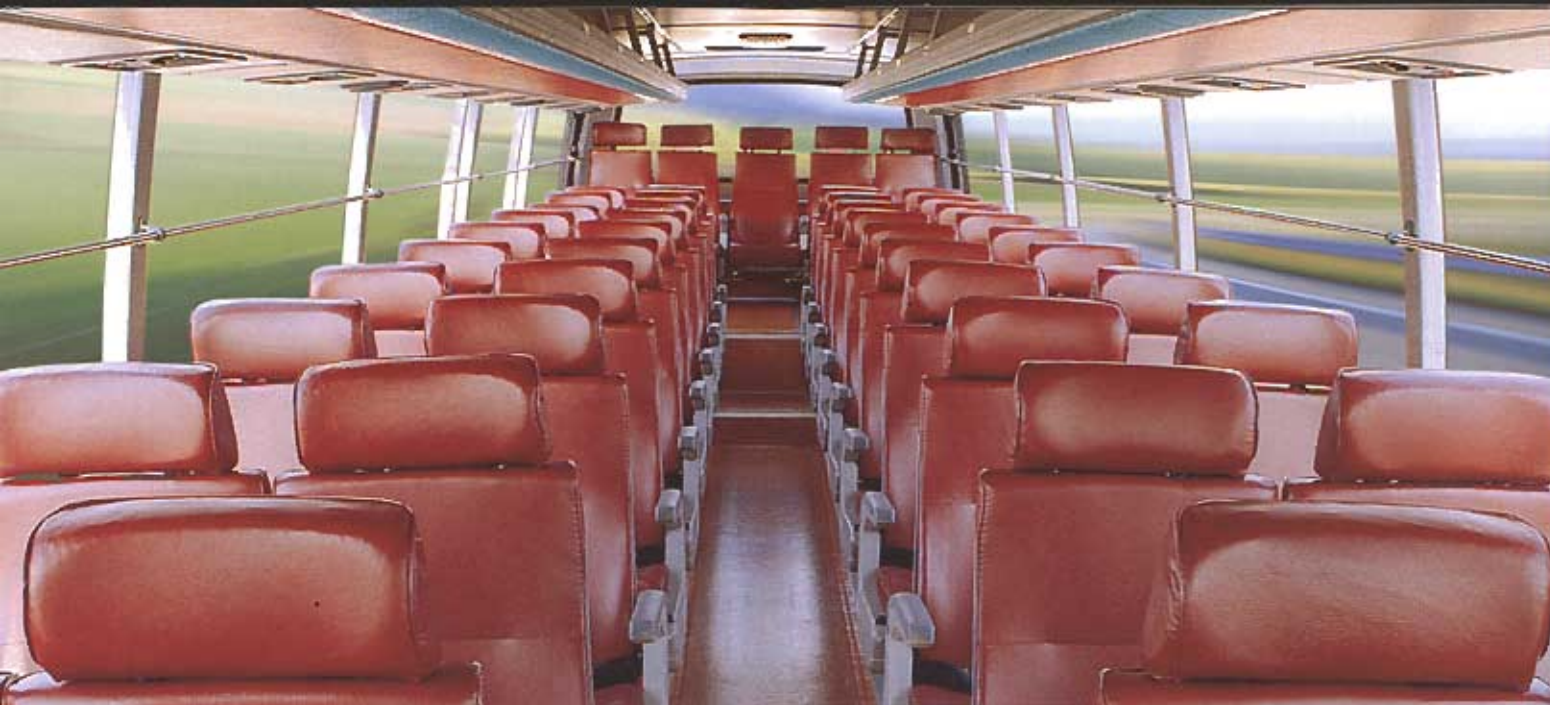
2 x 2 Seat arrangement