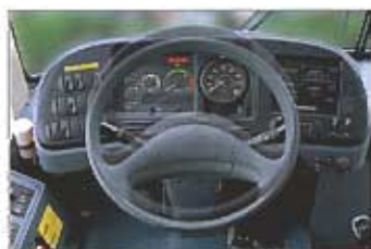
Till & Telescopic steering wheel