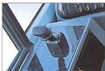
Gradual parking brake (option)