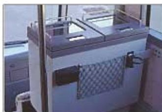
Hot & cold cabinet (option)