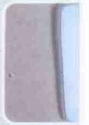
Lighting- Rounded the modern interior