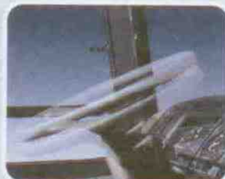
Power steering. Economic column