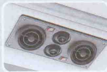
Comfort controls- Convenient individual