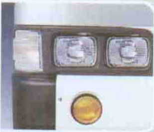
Rectangular multi-focus headlights and