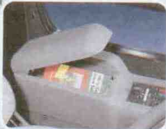
Audio system. The driver's left-hand