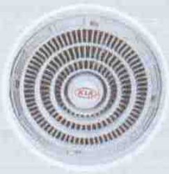
Exhaust fan- Convenient individual