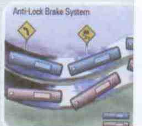
Anti-Lock Brake System and front suspension