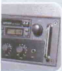
Systems- A 50-watt AM/FM