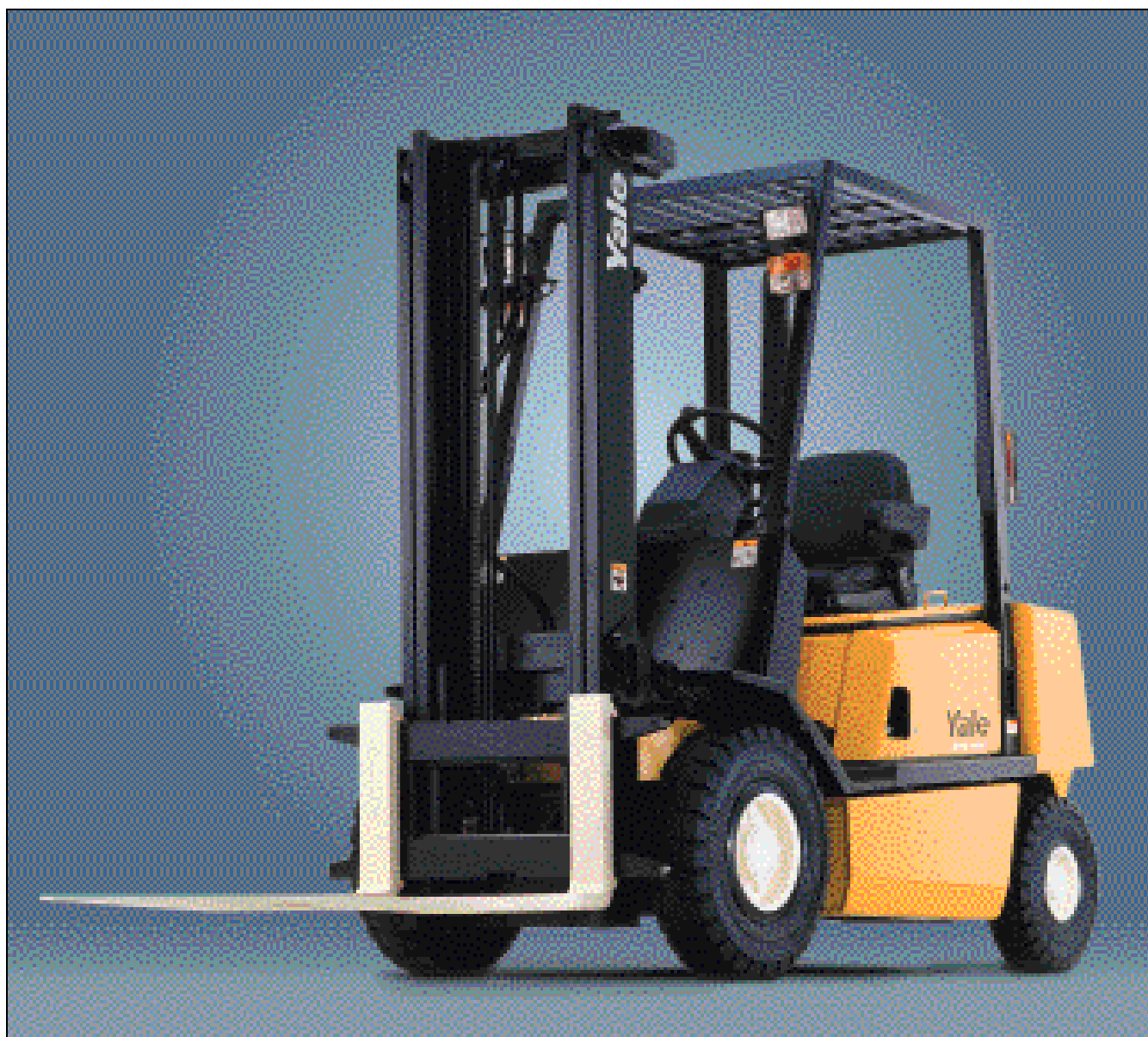
Truck shown with optional equipment