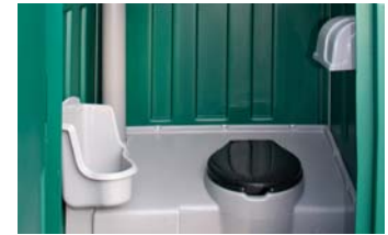
All PolyPortables' standard size units include a Pro60 Tank, urinal and toilet paper holder

Every PolyPortables' standard size unit comes with a ProServe60 tank... still called the best portable restroom tank on the market. Here's why!