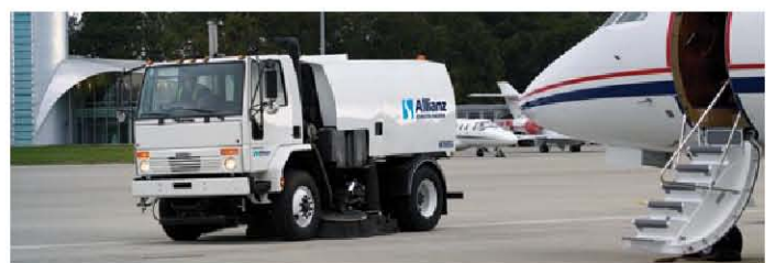
Tightest turning radius in its class.

The RT655 can be mounted on an assortment of Conventional and Cab Over Chassis, allowing users to standardize their fleets. Its compact design permits mounting onto a short 133" (338 cm) wheelbase truck resulting in unrivaled maneuverability.