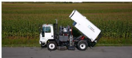
Hopper tips like dump truck-eliminating wear parts

In addition, the dust separator is automatically emptied each time the hopper is tipped eliminating unreliable cables and linkages.