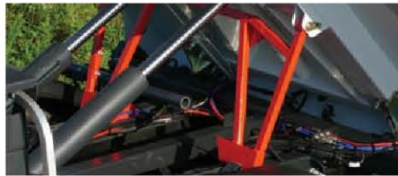
Automatic body prop ensures operator or maintenance personnel safety during equipment inspection.