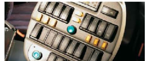
Single touch master control all functions

A single master sweep control 'ergo' switch raises/lowers, stops/starts all sweeping functions. Water can be automatically selected with each broom/sweeping function, eliminating switches and wires.