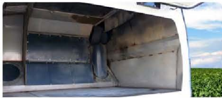
Stainless steel hopper resists corrosion

Allianz Sweeper Company has continually set the standard for debris hopper construction, while backing them with comprehensive warranties that safeguard your investment.